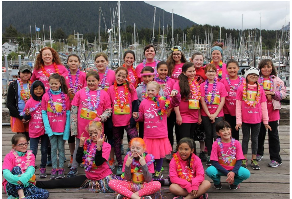
At the end of the run all girls came together for a photo. They received a medal and a colorful lei as a memento of this year's theme: beach, sun, and palm trees.