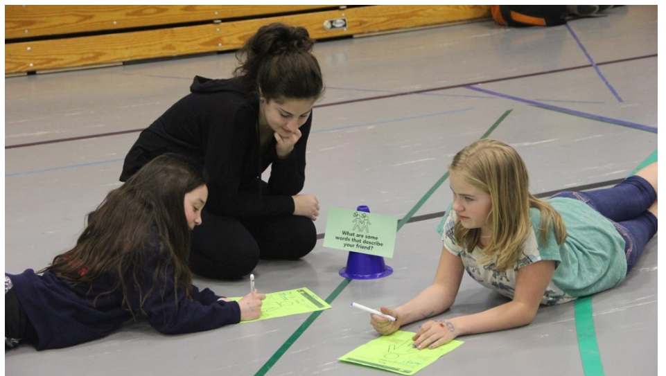
“What are some words that describe your friend” is one of many questions girls in this program are encouraged to think and write about.