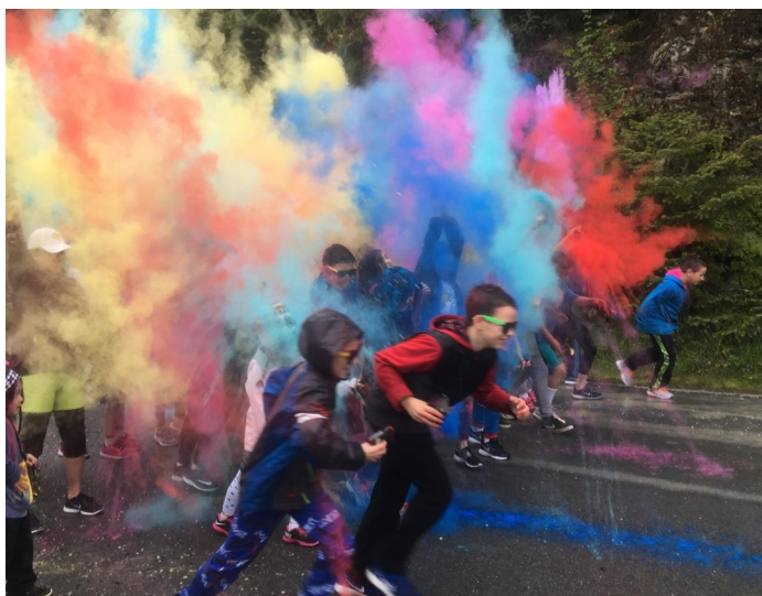
In Kake, girls and boys ran in a combined final 5K to celebrate the conclusion of Girls on the Run and Boys Run I toowú klatseen.

www.sitkayouthleadership.com/join-sylc .