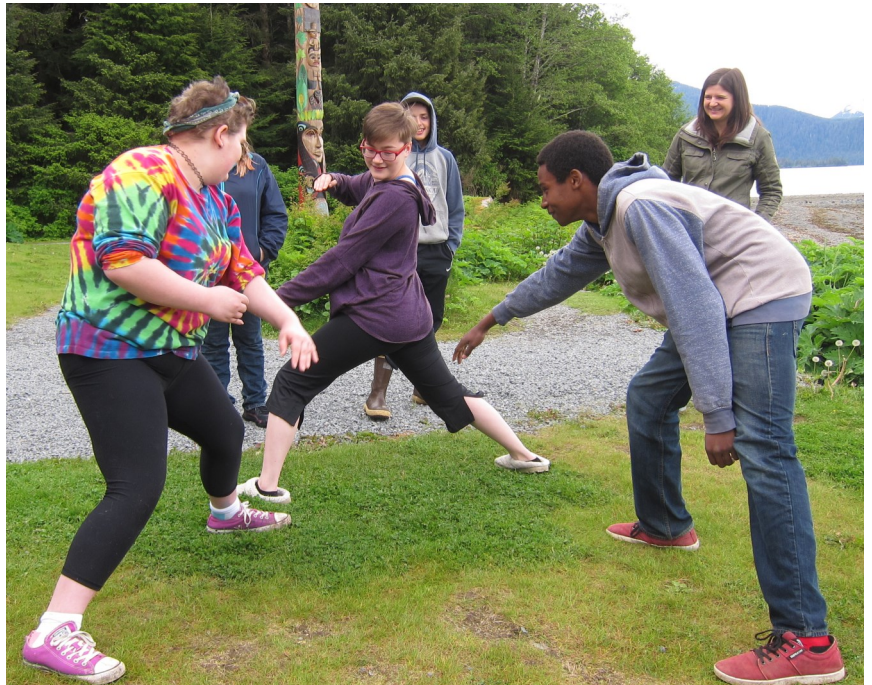
Participants play a game at the orientation day in Sitka before heading to Glacier Bay National Park and Preserve.

This year, the program was coordinated and implemented by the Sitka National Historical Park, Alaska Geographic, and SAFV.