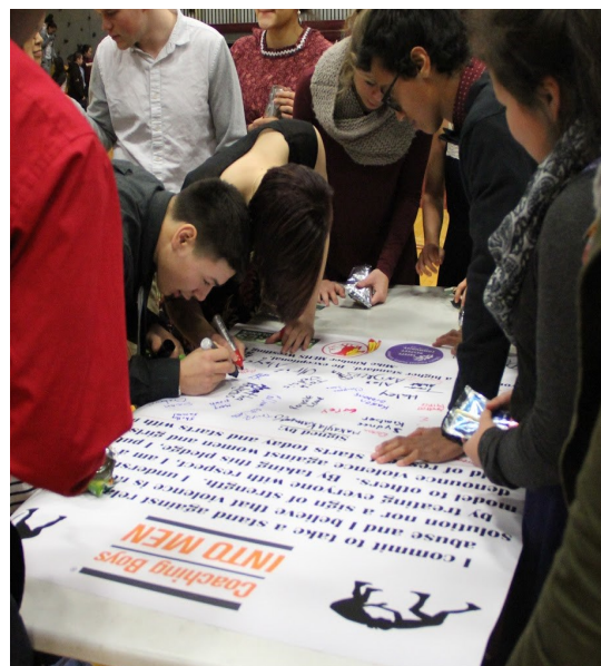
The wrestling team signs the CBIM pledge to respect others.